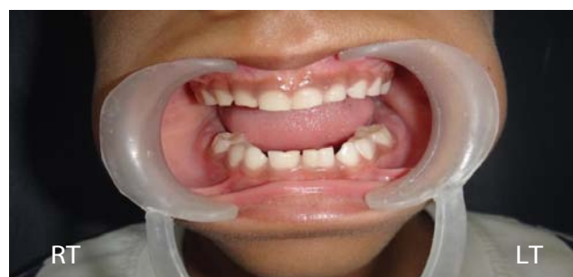
Figure A: Intra oral photograph of the patient showing fused 71, 72 and 81, 82.

An Intra Oral Periapical Radiograph (IOPA) was advised. Radiographic evaluation of the IOPA revealed fused 71-72; and 81-82 with two crowns and two roots fused together and two separate root canals, one in each of the fused teeth indicating that the fusion was of incomplete type. Absence of a single incisor was also observed on the radiograph (Figure B). To confirm the findings and to detect any other abnormality an Orthopantomograph (OPG) was advised. The