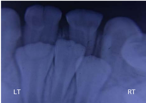
Figure B: IOPA radiograph showing fused 71, 72 and 81, 82 and absence of left permanent central incisor.

OPG confirmed the same findings (Figure C). It was very difficult to confirm whether the central incisor present in the middle was left or right at this stage as the three incisors were closely situated and were still within the bone. A thorough examination of the IOPA revealed that the middle incisor was right and the left incisor was missing. It was confirmed from the following ways 1. Morphology of the mamelons and crown found in the middle was much more like that of right mandibular permanent central incisor 2. This central incisor was present on the right side of the midline (Figure B) and 3. The path of eruption of the tooth present resembled more closely to that of right mandibular permanent central incisor. Hence, the patient was diagnosed to be a case of bilaterally fused mandibular primary central and lateral incisors of incomplete type with congenital absence of left permanent mandibular central incisor.